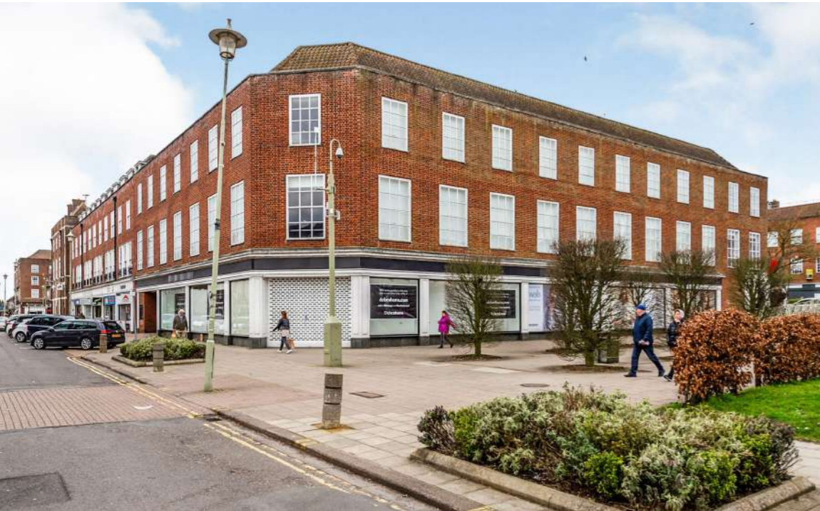
Stonehills, Welwyn Garden City AL8 A prominent former department store across 33,874 sq ft, with consent for conversion plus new build to provide 27 residential apartments.