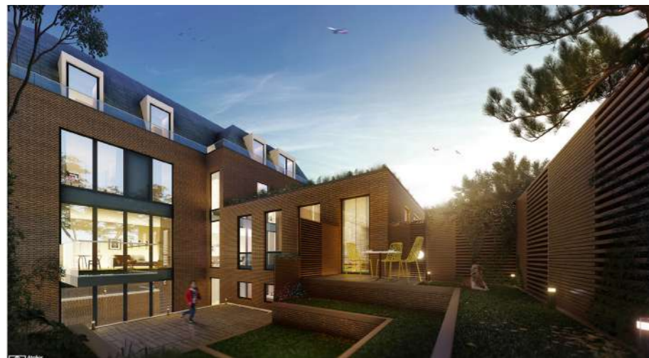
Edgware Constitutional Club, Manor Park Cresnet, Edgware HA8 Existing social club with full planning permission to demolish and create three commercial units plus 8 apartments.